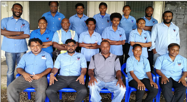
KIMBE CAMPUS STAFF PHOTO