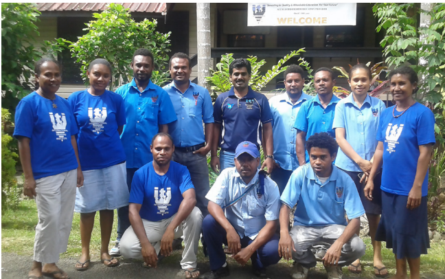
ALOTAU CAMPUS STAFF PHOTO