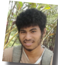
Korahi GOASA DHRM-Goroka Campus

“Blue, Green, Back and White Diamonds, squares and all patterns liked Carried by small children and all adult types Everybody’s favorite type Purple, Yellow, Red and Bright Carried by different Ethnic worldwide PNG Bilum Our Pride”.