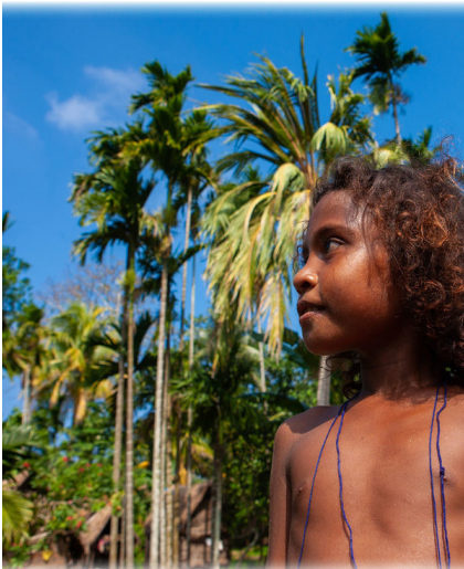
By: OWEN MOSILAGI DHRM -Alotau Campus

How should I not be glad to contemplate the clouds clearing beyond the dormer window and a high tide reflected on the ceiling? There will be dying, there will be dying, but there is no need to go into that. The lines flow from the hand unbidden and the hidden source is the watchful heart. The sun rises in spite of everything and the cities are beautiful and bright. I lie here in a riot of sunlight. Watching the day break and the clouds flying. Everything is going to be all right.