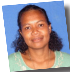
By: ELSIE DANIEL CHRM-Alotau Campus