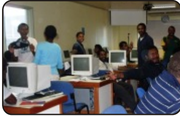
Internet Technology students psyching up for the cam.