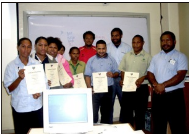
Kwila Insurance and Steamship Property course participants posing for the camera after the presentation.

Eurest South Pacific is another new corporate client that has just come on board. They have sent 5 of their participants to do Microsoft Excel 2003 Level 1 short course training. The participants have expressed great satisfaction in the way the training had been conducted. They are grateful that they are now acquainted with skills that they once lack. They hope to put it into good use and are looking forward to efficiency and productivity in their line of duty.