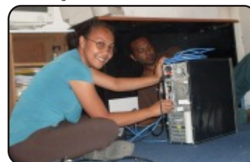
The Registrar trying out some of her hidden IT Skills supervised by the PROF.