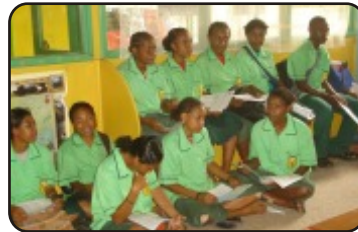
Laloki High School students attending a promotional seminar facilitated by ITI Marketing team