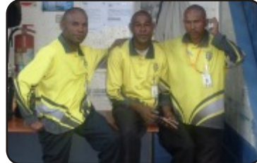
Original PLUS SECURITY posing for the cam @ the main gateway