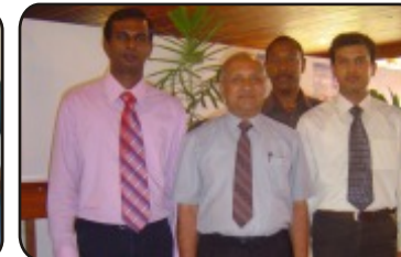
ITI Lae management with the guest @ the graduation ceremony recently