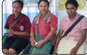
Smile Girls!! Your on camera.