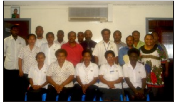
Course participants from the National Judiciary Staff Services, NJSS with the facilitator posing for the camera after the tea break.

A new client has come on board this month with 25 of its participants undergoing training on Quality Customer Service. This new client is a company called East West Transport. Their Head office is in Port Moresby and they have a branch in Lae. Eleven of those participants were from Moresby and they did their training here at ITI Pom campus whilst the other 14 participants who were from Lae did their training in ITI Lae campus.