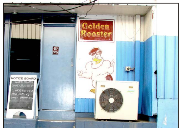
Front entrance of Golden Rooster.

Local take away food shops are a fair distance from the institute therefore staff and students are encouraged to purchase food on campus for their own convenience and safety. Check it out for yourself!!