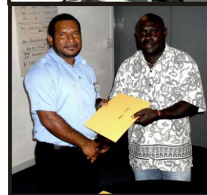
Pictorial of participants from various organizations which attended corporate training at ITI POM campus